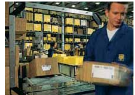
Manual Postal sorting