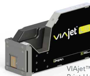
VIAjet™ L-Series L12 Print Head