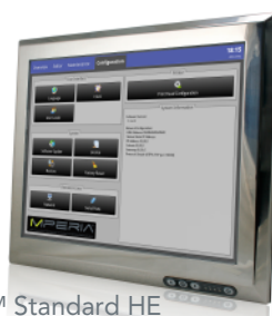
MPERIA™ Standard HE