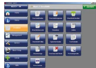
Straight forward operation