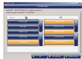
User and Permission Management