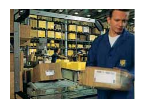
Manual Postal sorting